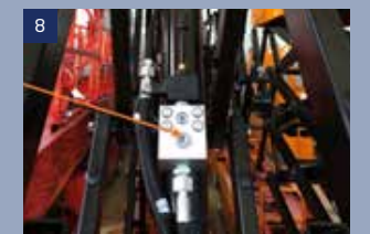
Explosion proof valve: To prevent the machine falling when the oil pipe is leaking