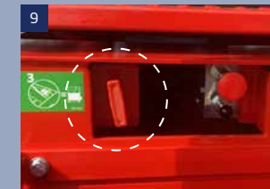
Manual lowering valve: When the operation system failed or the battery power is too low to let the platform decline, we can use this valve to lower the machine