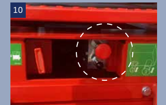
Manual release valve: When the machine can not move, you can push the machine after pressing this valve