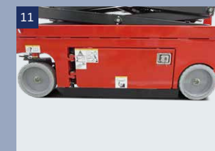
Anti-overturning system: When the machine raises to more than 6.5ft, this system will work automatically, to protect the machine from overturning while walking on un-leveling ground.