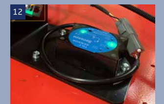
Angle sensor: when it is lifting and walking on the slope, the sensor will automatically judge the status of the machine, if the angle is larger than the rated angle, it will alarm to remind the operator.