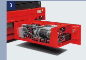
Hydraulic and electric system