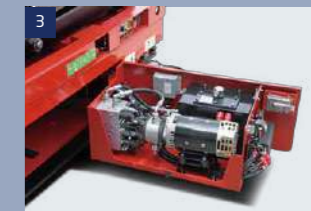
Hydraulic and electric system