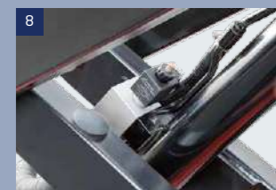
Explosion proof valve: To prevent the machine falling when the oil pipe is leaking