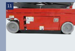
Anti-overturning system: When the machine raises to more than 2m, this system will work automatically, to protect the machine from overturning while walking at un-leveling ground