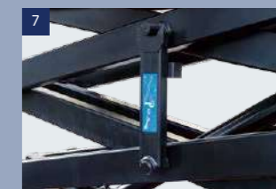
Supporting arms: To protect the operator when he is doing repair or maintenance job