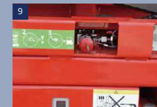
Manual lowering valve: When the operation system failed or the battery power is too low to let the platform decline, we can use this valve to lower the machine