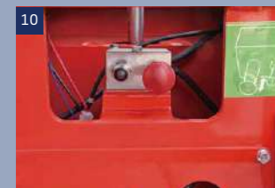
Manual release valve: When the machine can not move, you can push the machine after pressing this valve