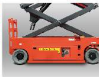
Auto-protection on holes on the ground