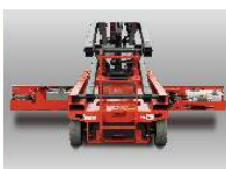
Rotary maintenance pallet