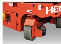
Small turning radius