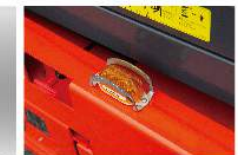
Emergency falling and dual flashing warning lights