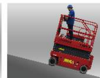
Strong climbing ability